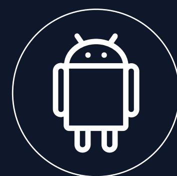
Android 12 Operating System