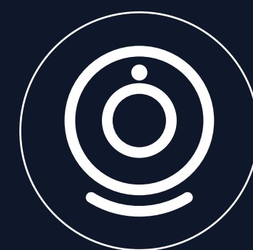
Front 5M Rear 13M